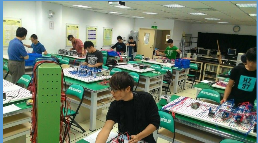
Studies for Industrial Logical Control Systems, Pneumatic Actuating Systems, Mechatronics, Logical Control Designs with PLC, etc.