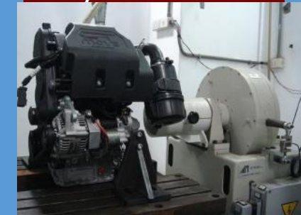
Diesel engine dynamometer