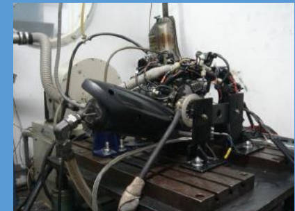
gasoline engine dynamometer