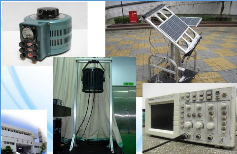
Solar Tracking System

Research : Optoelectronic packaging, abrasive machining (precision machining), optical lens design